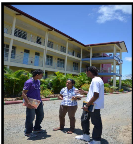
UPSM Students in front of the newly built Medical school building