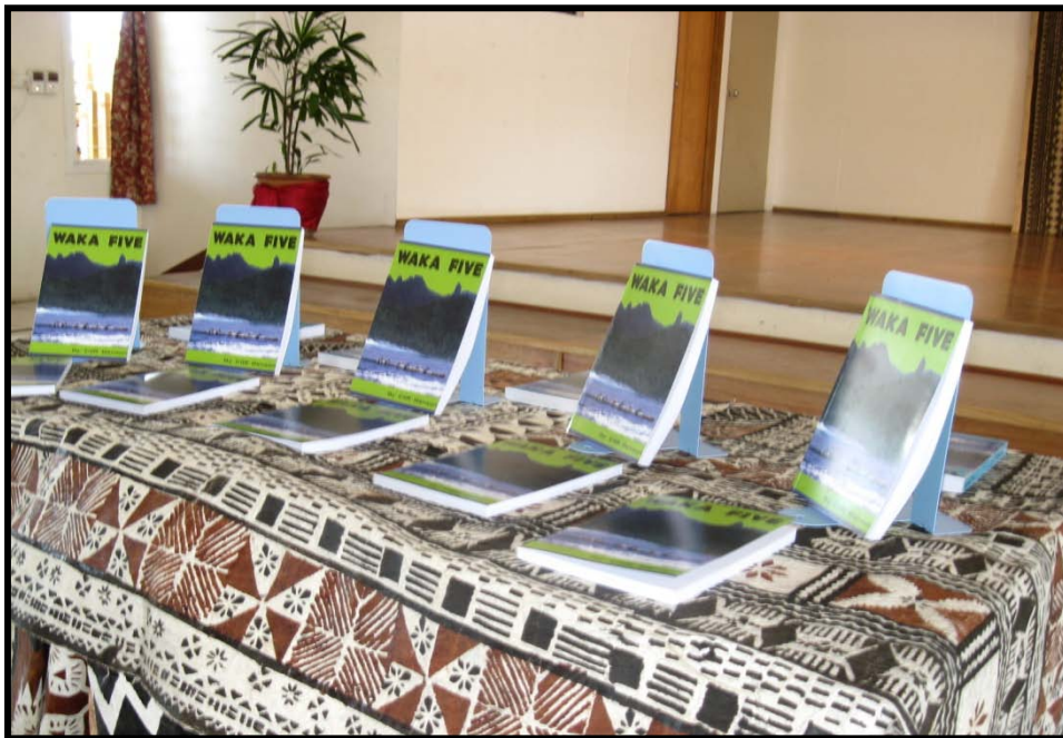
Launch of Waka Five at UniFiji