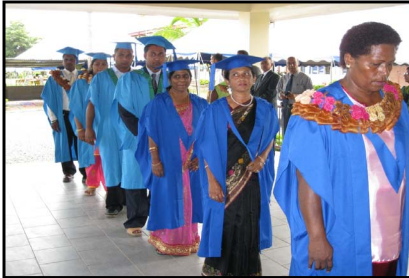
Second Graduation held on 3 April 2009