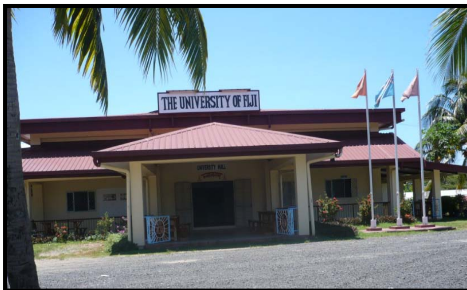
View from the of the University

The next election would be held in the beginning of Semester 1, 2010.