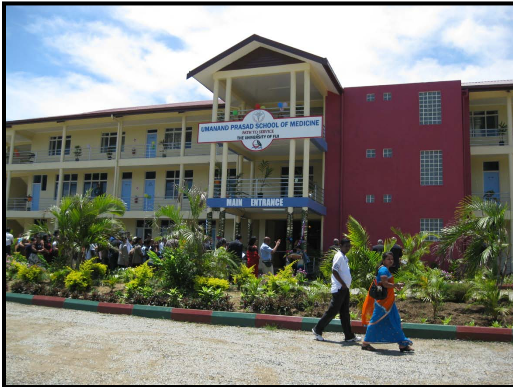
This picture was taken during the opening of the Umanand Prasad School of Medicine

With these developments, and the promise of the continuation of scholarships for the MBBS programme by the PSC and the FAB, UPSM hopes to see more students wanting to enrol in our MBBS programme in 2010.