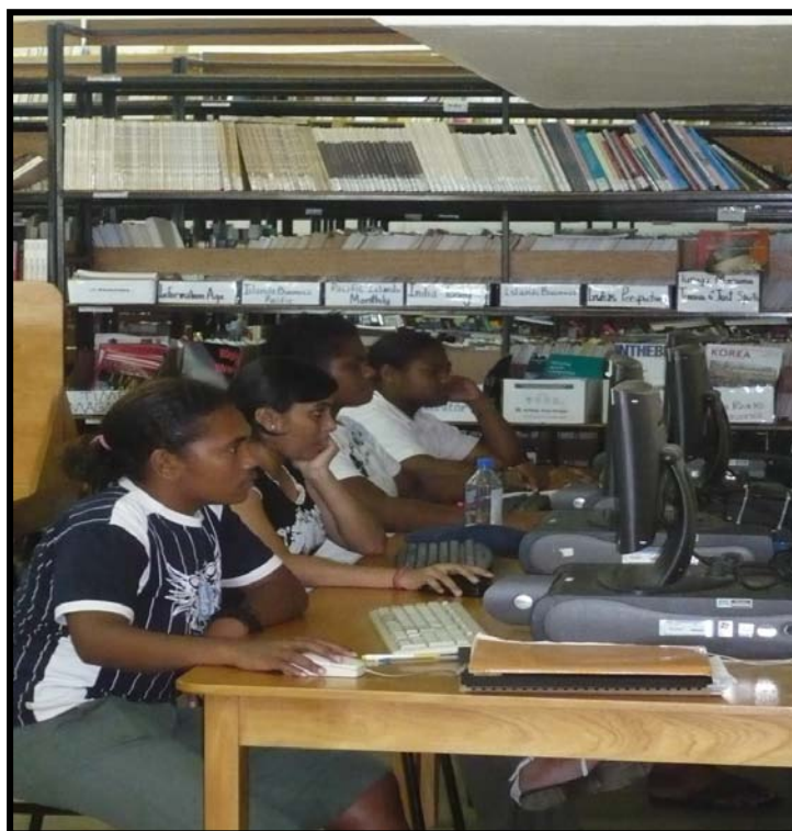
Students using the computers in the Library during orientation.

Library Orientation Program; In order to introduce and familiarize the new library system, 11 sessions of Library orientation programs were organized for library users in July and August.